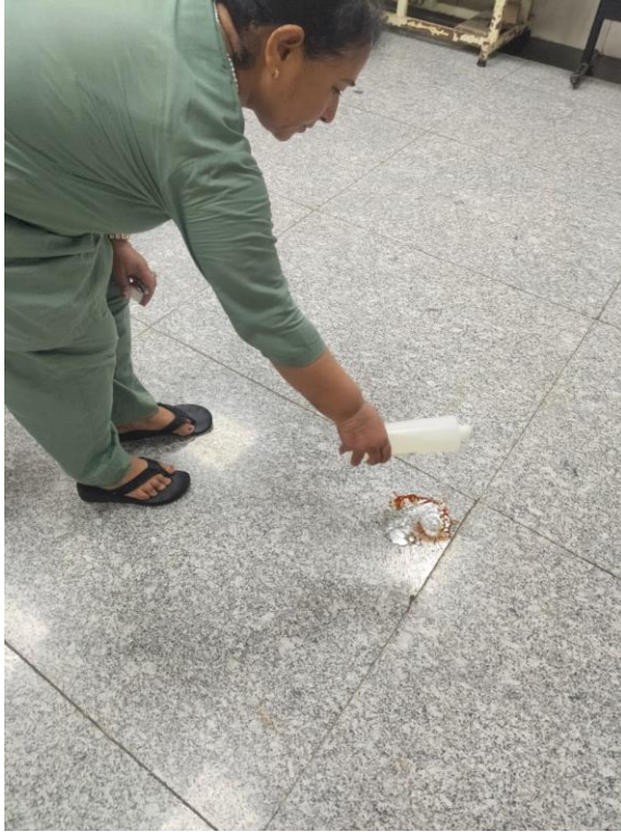
Mock drill for spill management

Activity Conducted: A mock drill for fire and spill management was done in SGMH along with focusing on landscaping and gardens maintenance.